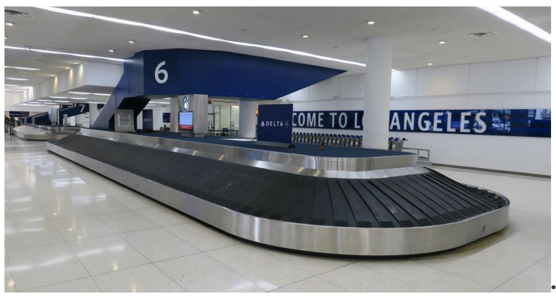
Baggage Claim 6 has reopened in Terminal 3, with Baggage Claim 5 the next to be replaced this month.

offers bus service to Terminal 3 and Terminal B/TBIT from Gate 21. Seat cushion replacement will take place overnight.