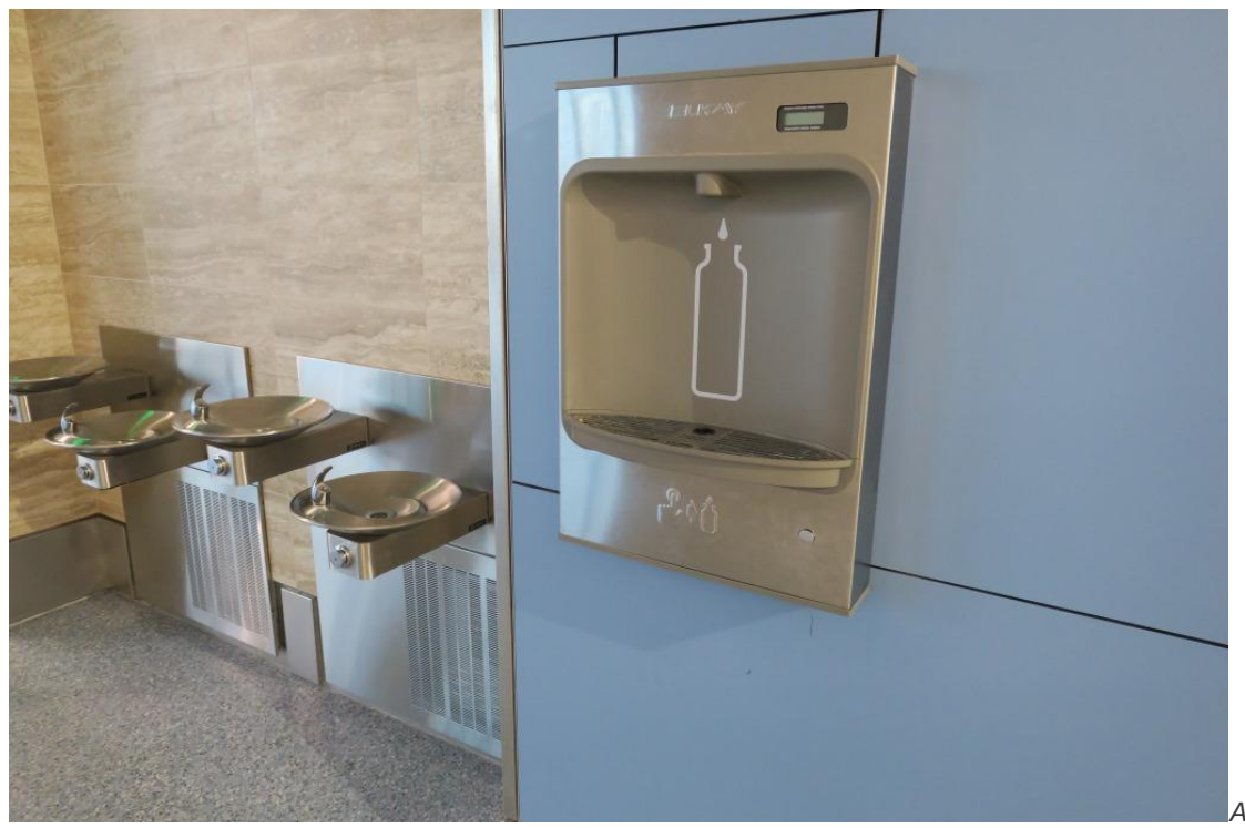
water-bottle filler has been installed in the new restroom core between Gates 9 and 10 in Terminal 1.