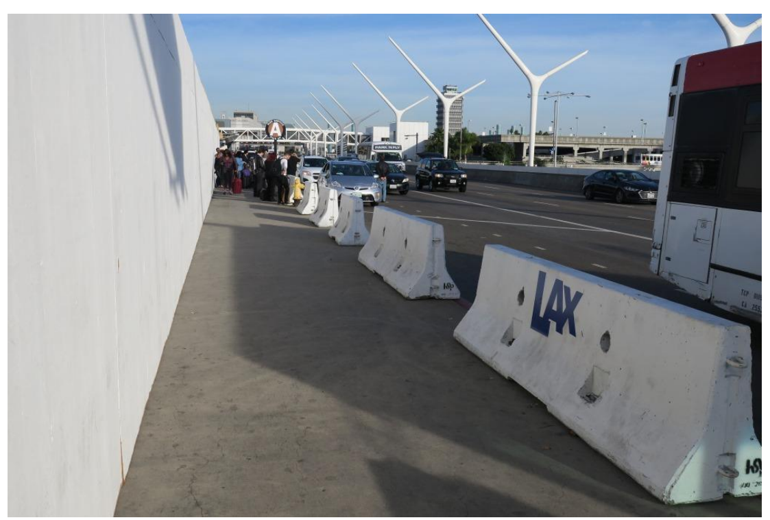
K-rail barriers have been installed in several areas of the Central Terminal Area for pedestrian safetry, including the Upper/Departure Level, near the future Terminal 1.5.

• Terminals 7/8: United Airlines is continuing its $573-million Terminal 7/8 Renovation Project scheduled for completion this upcoming spring. The eastern portion of the Security Screening Check Point has opened, adding more of the Automated Screening Lanes that allow up to five passengers to fill their bins at the same time. A portion of the sidewalk on the Lower/Arrivals Level is closed. Skycaps will be moving to new podiums over the next two months. Gate 83 is closed for renovations. Improvements are also underway in the seating area at Gate 72. New men's restrooms have opened between Gates 72 and 74 and the women's restroom between Gates 75A and 75B has reopened as well. Water-bottle fillers are now available across from Gate 75A as well as adjacent to the women's restroom at the north end of the concourse. The restrooms near Gate 84 are closed for renovation. With work completed on the new Baggage Carousel 2, the terminal has four carousels available. United's new baggage service area is also open.