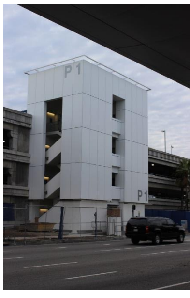
New elevators and metal panels were installed at the West tower in 2016.