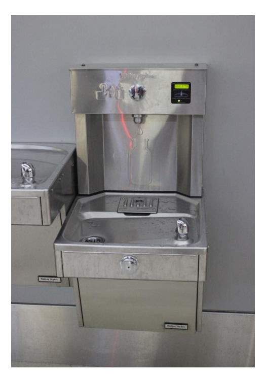
A new water bottle filler is available near Gate 71B in Terminal 7.

with the water fountain near this location. Work continues on a new Baggage Carousel 1, with temporary walls in place. The United Baggage Service office is in a temporary location near the new restrooms on the west end of the baggage claim area, and must be accessed from the street. Terminals 7 and 8 can be reached using East Way, a short-cut between the northside and southside terminals that eliminates the need to travel around the entire Central Terminal Area.