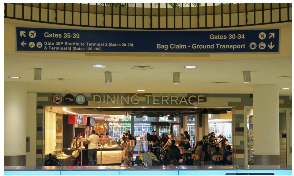
A new Dining Terrace, including Panda Express, Ashland Hill and Earthbar, has opened in Terminal 3.

• Metro will suspend rail service on the Green Line west of Hawthorne/Lennox Station beginning at 9 p.m. on January 26 and continuing until early April while building a connector to the new Crenshaw/LAX Transit Projects. While Metro will provide a bus that stops at the remaining Green Line stations, the LAX G Shuttle will pick up and drop off passengers at a stop on southbound Hawthorne Boulevard, just north of Imperial Highway, so they can board the Green Line at Hawthorne/Lennox. The G Shuttle will not service the LAX/Aviation Station while rail service is suspended.