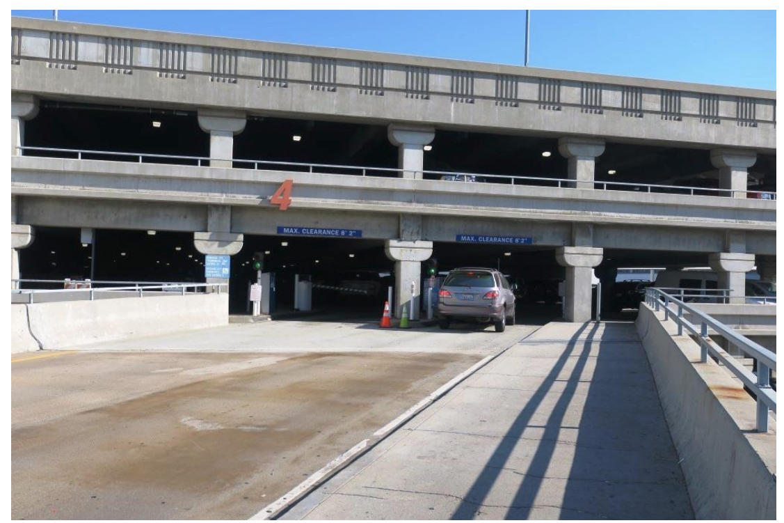
Access to Parking Structure 4 from the Upper/Departure Level will be closed in mid-January, when work begins on installing new ramps to reach Levels 4 and 5.