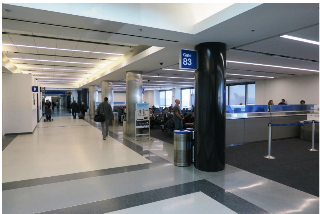
Gate 83, at right, has reopened in Terminal 8 while renovation work continues in the men's and family restrooms at left.