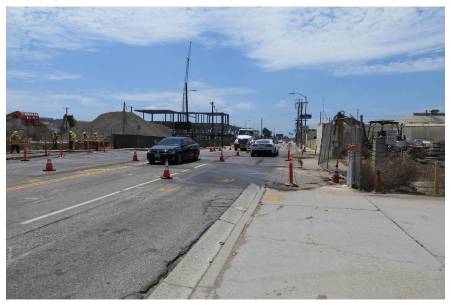
LA Metro will close this stretch of Arbor Vitae Street, between Aviation Boulevard and Bellanca Street, for two weekends in September to reinforce the roadway and lay down tracks for the Crenshaw/LAX Line.

A detour will be posted both weekends, using Aviation Boulevard, Manchester Avenue and Airport Boulevard to get around the closure. Bellanca Avenue will remain open for access to rental car agencies and other businesses. In addition, the curb lane on Arbor Vitae Street will be closed daily through Sept. 8 for installation of the rails.