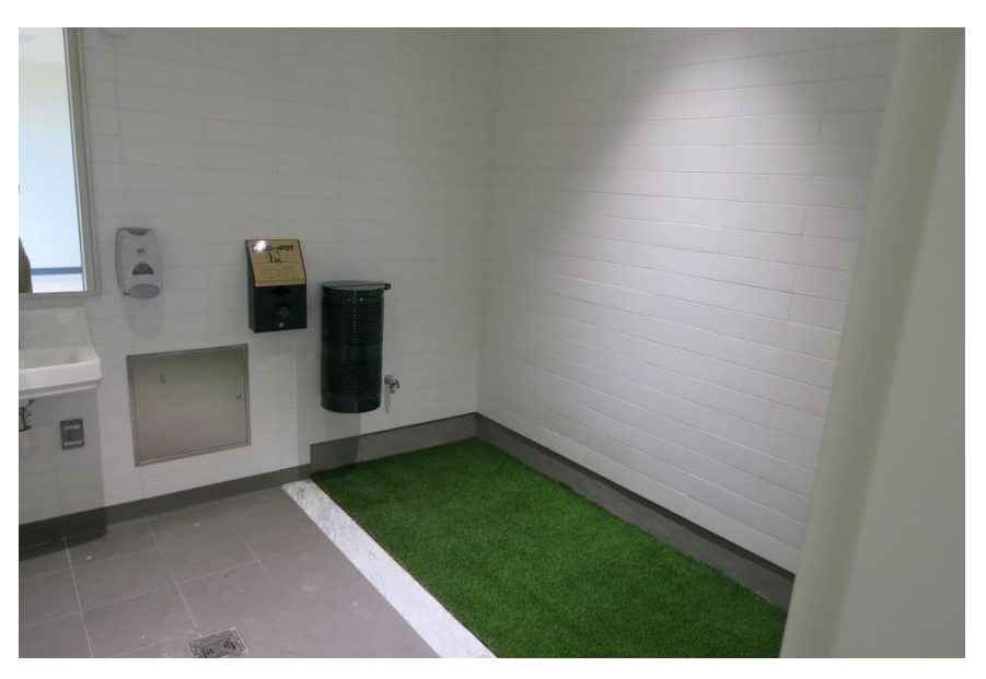
A new service animal relief area has opened in Terminal 7 near the connector to Terminal 6.

men's restrooms have opened near Gate 70A and between Gates 72 and 74 while the women's restroom between Gates 75A and 75B is closed for renovation. Water-bottle fillers are now available across from Gate 75A as well as adjacent to the women's restroom at the north end of the concourse. A new pair of escalators leads passengers from the concourse to baggage claim, and two new elevators are also available to access the arrivals level. The old escalators will be removed. Construction barricades have been installed around Baggage Carousel 2, which is being replaced, with work scheduled until late December. Passengers can access Baggage Carousels 3 and 4 from the street level. The bridge from Parking Structure 7 has reopened.