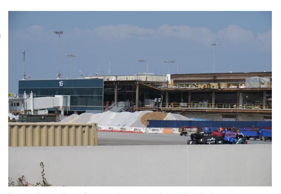
Renovation work continues on Gates 14 and 16 at Terminal 1.

checkpoint. The food court near Gates 10 and 12 will close on Sept. 4, with passengers directed to other establishments further north in Terminal 1. Westfield is phasing in new concessions through 2018. On the way to the baggage claim area, arriving passengers will be directed to the right when they reach the bottom of the escalators. Renovation work in the area of the escalators will take place overnight, with arriving passengers directed to the escalators in the Security Screening Check