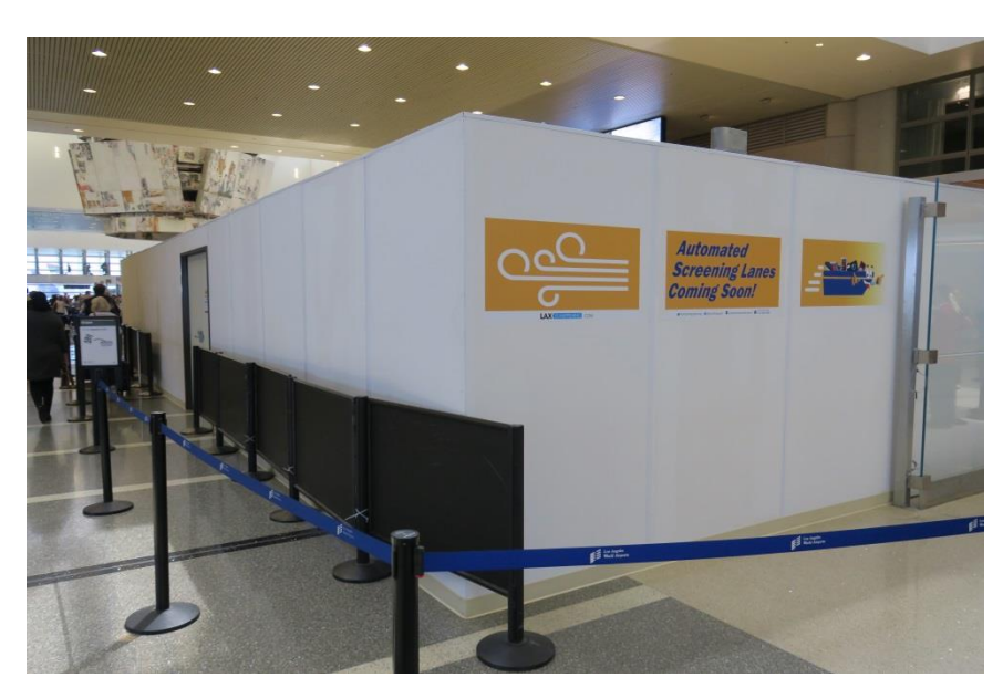
Temporary walls have been installed as work begins on installing new Automated Screening Lanes at the Tom Bradley International Terminal.

a second time by using the Terminal 4 Connector. Work has begun to upgrade 14 of the 16 lanes in the Security Screening Check Point to Automated Screening Lanes, which process approximately 30 percent more passengers per hour.